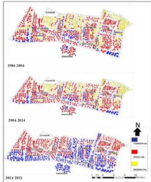
Figure 3: The pattern of land use from 1984-2021

Figure 3 shows the pattern of change in use from 1984 to 2021. The period 1984 to 2004 shows high mixed-use blocks in the western area (Stadium and Cathedral area) and high residential use in the northern part (Carr Street and Araromi area) dotted with commercial use in the northeastern part of the area (Ijomu and Obanla area). Nevertheless, by 2004-2014, residential development had declined to 48.5% while mixed-use increased by 9.36% and commercial land use conversion increased by 32.04%; commercial land use is growing gradually within the core. From 2014 to 2021, only a few fully residential blocks remained unconverted, with more mixed-use at the northeastern part of the core. This is unsurprising since these areas are close to Oja Oba (the main market), like the Ijomu and Obanla areas. Also, the northwestern part of the area is another significant area of mixed-land use, whilst the residential use had been combined with commercial use due to its closeness to the Arakale market. As one moves southwards towards the market of Oja Oba and Arakale, buildings become fully for commercial purposes. During this period, there was no building blocks conversion to full residential use, 0%, while mixed land building block conversion was